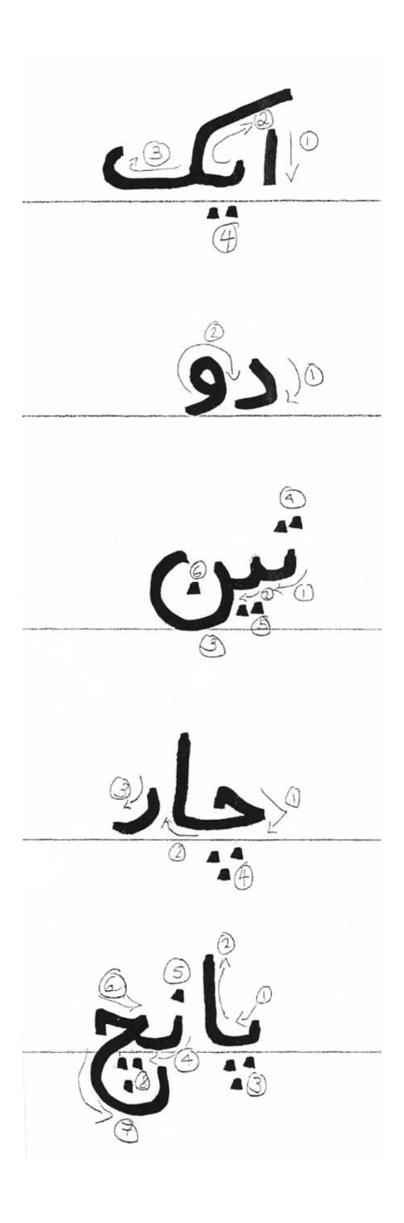
Task 2 Literacy subskills