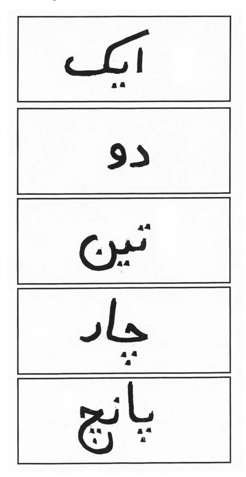
Task 2 Literacy subskills